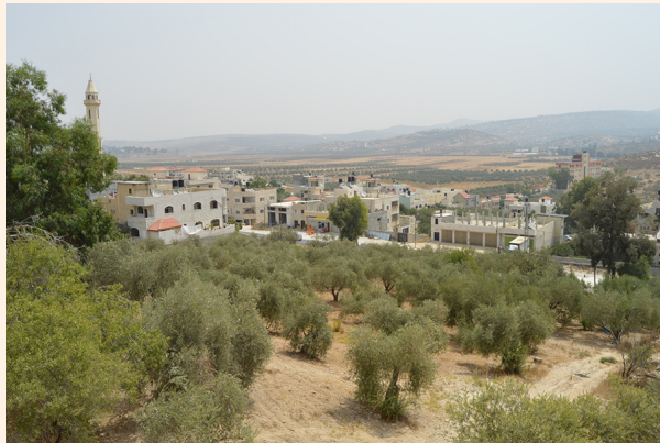
The town of Huwara, near Nablus in the West Bank